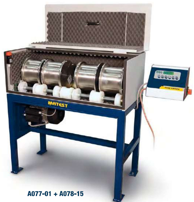
A077-01 + A078-15