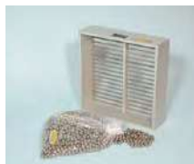
A078-11N + A048-14