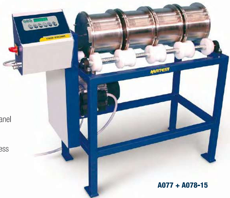
A077 + A078-15